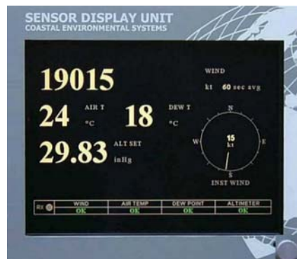
TRACON display design – Flat Panel

The PC-based display has identical graphics to the pictures above, except on a CRT type screen. A new Flat panel screen can also be used, providing the advantage to view other data from the PC.